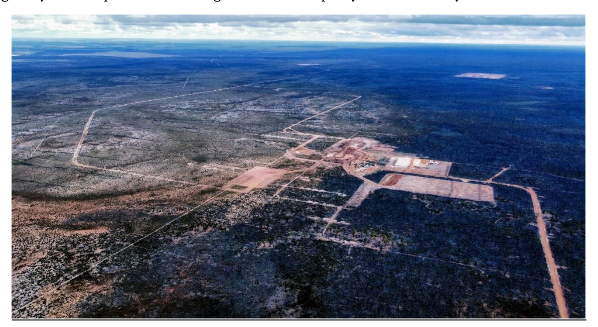
Figure 1 Kat Gap mine site

The Company focused all its efforts during the quarter to bring the Kat Gap gold project closer to production. Most of the work was centred primarily on trial mining and milling activities. This included the calibration of the Kat Gap processing facility to capture data enabling refinement of the gravity circuit operation. Marking out of the trial pit by contract surveyors was also undertaken.